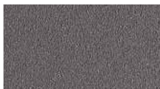
Graphite grey NCS S 7500-N RAL 7024