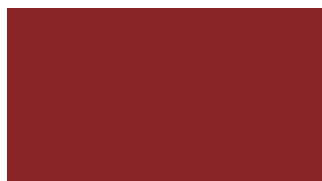
Brown red RAL 3011 NCS S 3560-Y90R